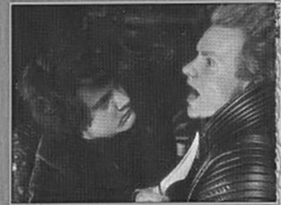
FEYD GETS STUNG!